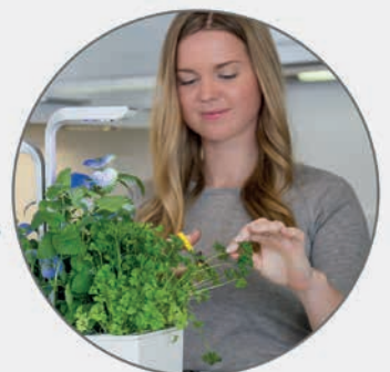
Harvest & taste