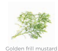
Golden frill mustard